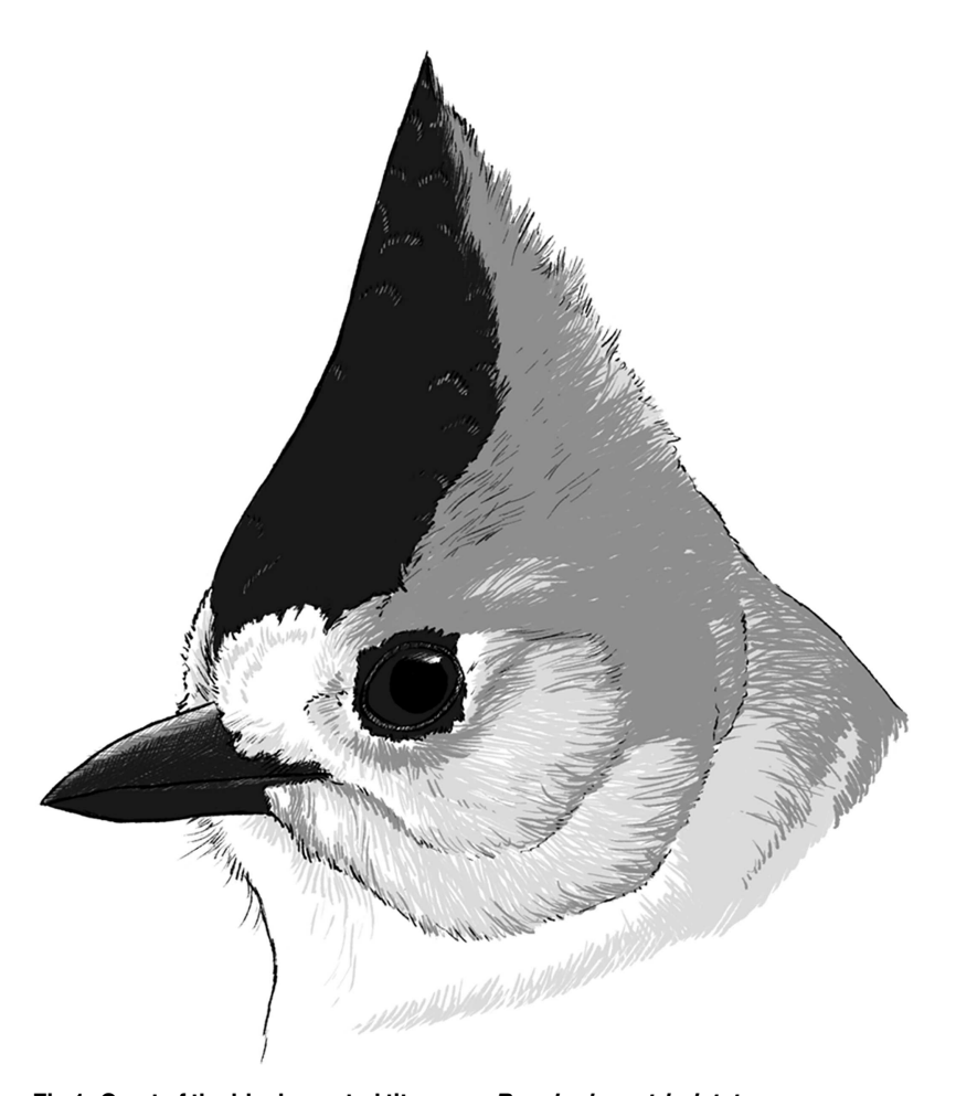
Fig 1. Crest of the black-crested titmouse, Baeolophus atricristatus.

https://doi.org/10.1371/journal.pone.0185584.g001